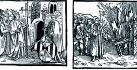
Antique prints depicting the phases of the Miracle