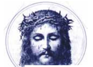
Ancient print representing the Prodigy