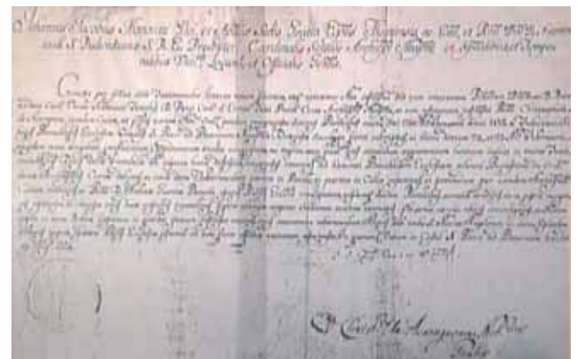
Document in which Cardinal Ursi elevates St. Peter's Church to a diocesan Eucharistic shrine