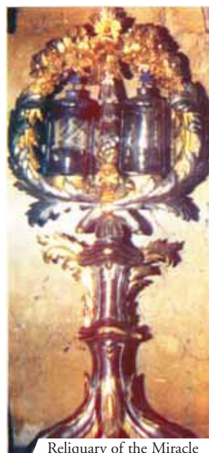
Reliquary of the Miracle