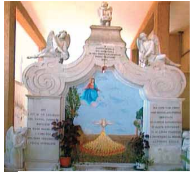
A plaque at the place where the Hosts were found