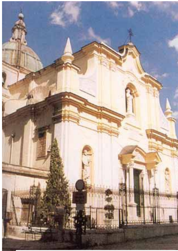
St. Peter's Church, Patierno

In 1971 the Eucharistic Year of the diocese has been established in order to allow the community to capture the essence of the Eucharistic miracle. Unfortunately in 1978 some unknown thieves were able to even steal the relic with the miraculous Hosts of 1772.