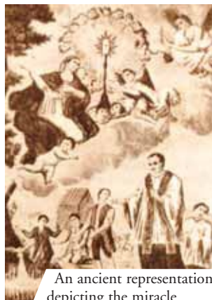
An ancient representation depicting the miracle