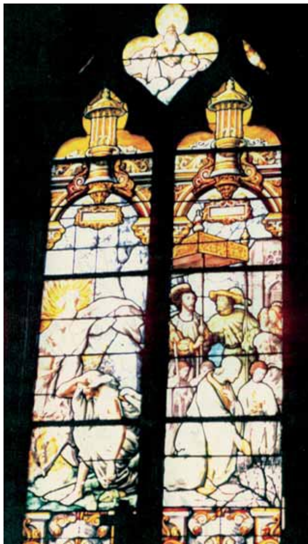
Window depicting the miracle

In 1533, some thieves stole a ciborium containing some consecrated Hosts from a church. The thieves then discarded the Hosts in a field. Unfortunately there was a strong snow storm; however, the following day the Hosts were recovered and miraculously were found to be in perfect condition. The numerous healings and the tremendous popular devotion that followed the miracle were not sufficient to protect the Hosts which were destroyed by some seeking to profane them.