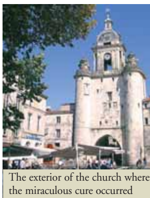
The exterior of the church where the miraculous cure occurred