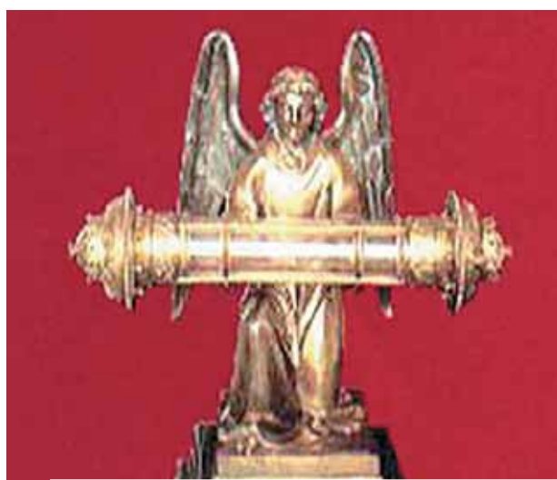
Reliquary of the Precious Blood

There are two drops of blood from our Lord, Jesus Christ, collected on Calvary during the Passion preserved in the church of Neuvy-Saint-Sépulcre in Indre. They were brought to France in 1257 by Cardinal Eudes returning from the Holy Land.