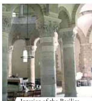
Interior of the Basilica