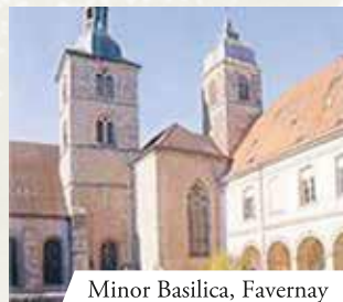
Minor Basilica, Favenerney