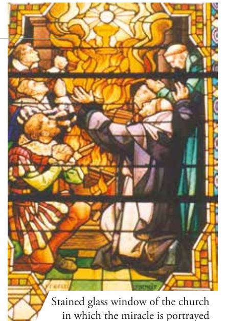
Stained glass window of the church in which the miracle is portrayed

In the 17th century, Protestantism and Calvinism spread quickly in France by means of the many material benefits conceded by the new religions to the members of the nobility and the clergy coming from the Catholic Church. This placed at risk the faith of many and created many uncertainties, even in the monasteries. In the city of Favenerney there was a Benedictine Abbey whose monks had departed a great deal from the rule of their founder. They had only in high-esteem the devotion to the Lady of Notre-Dame la Blanche, known in all the area for its many miracles. Through her intercession many miracles had in fact been verified, among which was even the returning to life of two infants who were not yet baptized. In 1608, on the Vigil of the Feast of Pentecost, the monks decided to prepare an altar for the exposition and adoration of the Blessed Sacrament. The lunette of the monstrance was very