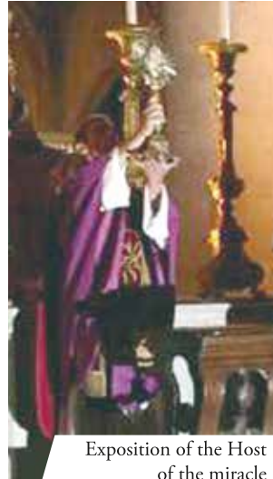
Exposition of the Host of the miracle