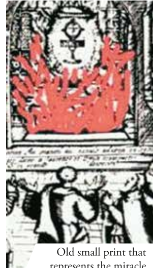
Old small print that represents the miracle