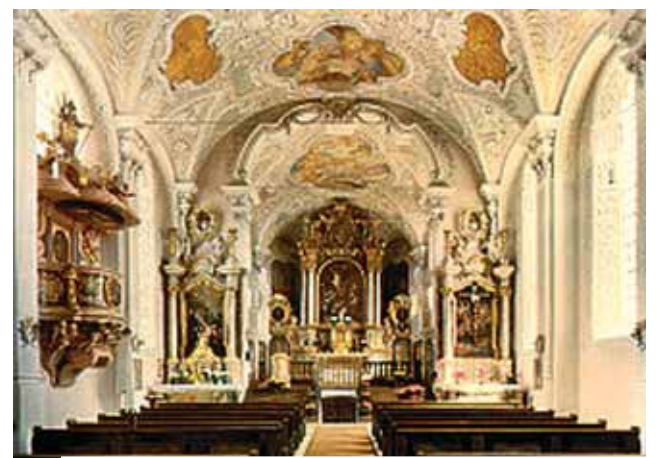
Interior of the Sanctuary