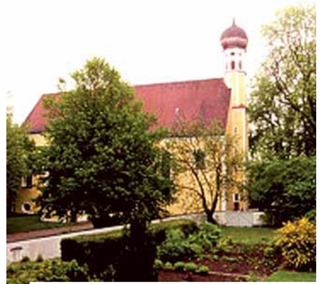
Sanctuary of the Most Precious Blood

A poor peasant of Erding could find no way to improve his economic state, despite working many hours every day. His neighbor on the other hand, who did the same work, succeeded in living prosperously. One day the peasant asked his neighbor how he had succeeded in earning so much and the man confided to him that his success was owed to the fact that he kept the Blessed Sacrament in his house. The poor peasant, ignorant in the faith thought that the Blessed Sacrament was a type of amulet, and decided to imitate his neighbor. He went to Mass on Holy Thursday and after having received Communion, hid the Host in his clothes and left the church with It. During his journey, however, his conscience began to accuse him, so he decided to bring the particle back. During the trip, however, the Host slipped from his hand and