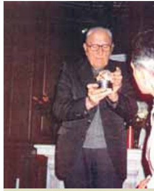
Year 1975. The Pastor of the Church of St. Peter shows the Host of 1254.

In the Eucharistic Miracle of Douai, a consecrated Host was unintentionally dropped to the ground while a priest was distributing Communion to the faithful. Immediately he bent down to pick it up, but it lifted itself up in flight and went to place itself on the purificator. In its place, a little later, a wonderful child appeared, who all the faithful and religious present in the celebration could contemplate. Although more than 800 years have elapsed, even today it is still possible to admire the Host of the miracle. All Thursdays of the month, in the Church of Saint Peter of Douai, many faithful gather in prayer before the miraculous Host.