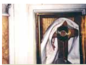
Tabernacle where the Host of the miracle is kept