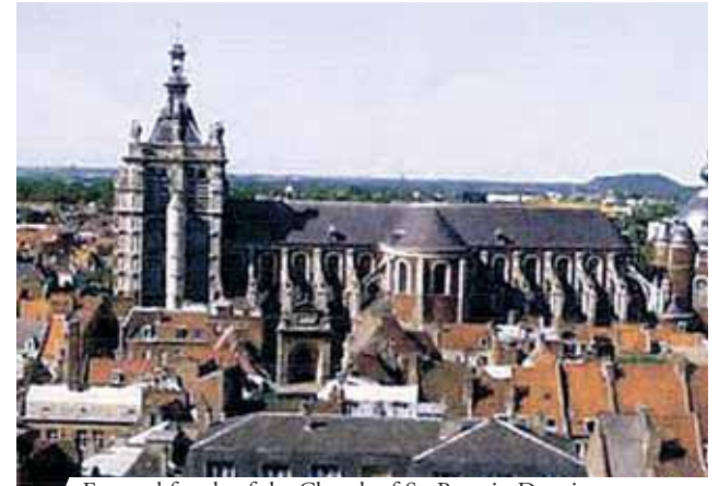
External façade of the Church of St. Peter in Douai