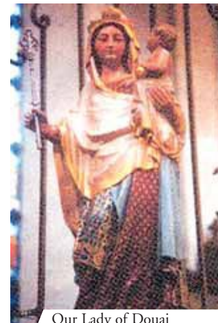
Our Lady of Douai