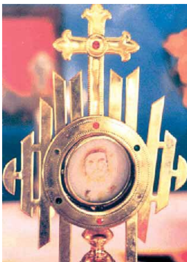
Monstrance containing the Particle in which the image appeared