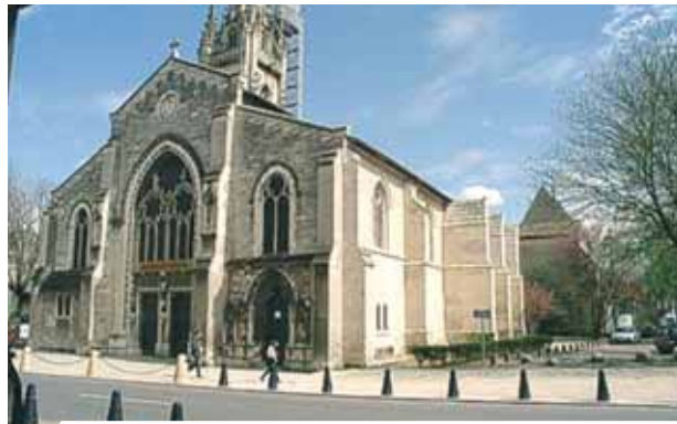
Church of St. Eulalia in Bordeaux

In the Eucharistic Miracle of Bordeaux, Jesus appeared giving a blessing for more than 20 minutes in the Host exposed for public adoration. Even today it is possible to visit the Chapel of the Miracle and venerate the precious Relic of the Monstrance of the apparition, which is kept in Martillac, France, in the church of the contemplative community “La Solitude”.