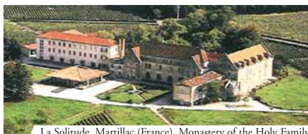
La Solitude, Martillac (France), Monastery of the Holy Family