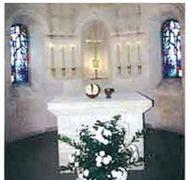
Interior of the church “La Solitude”