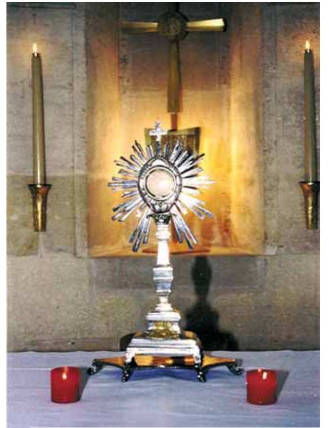
Monstrance of the miracle