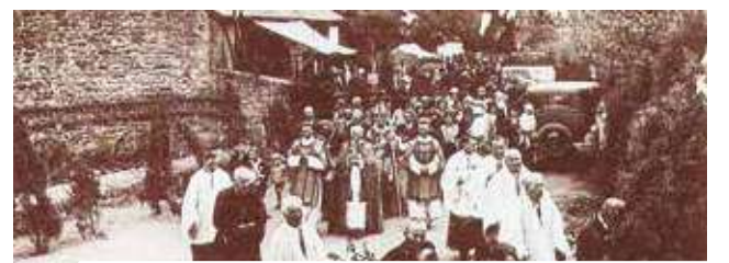
Procession in honor of the Miracle