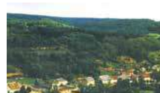
View of the village of Blanot