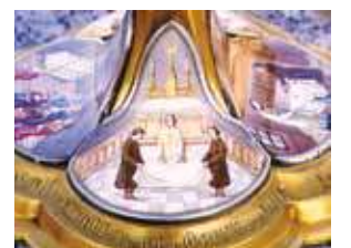
Details of paintings that decorate the Monstrance