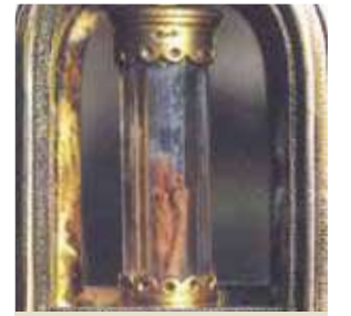
A 17th century display case containing the cloth stained with blood, preserved in a crystal tube. Blanot