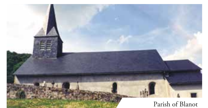
Parish of Blanot