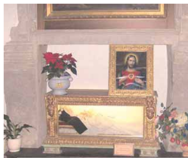
Chapel with the urn of Blessed Giovanna