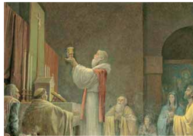
Picture that depicts the miracle present in the basilica