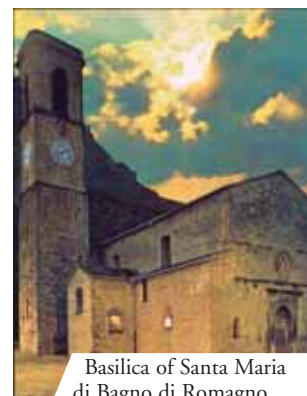
Basilica of Santa Maria di Bagno di Romagna