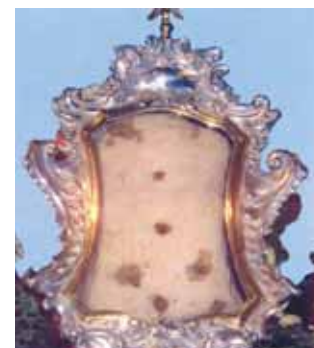
Relic of the Blood-stained corporal