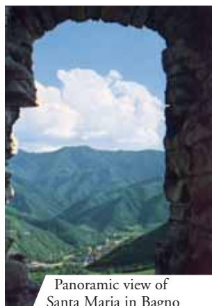
Panoramic view of Santa Maria in Bagno