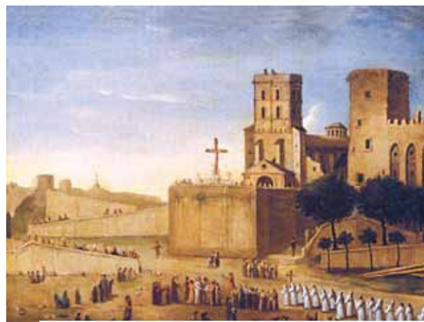
Palace of the Popes, Avignon