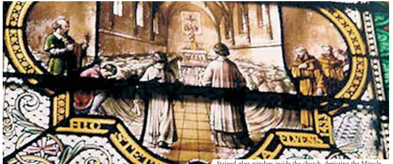
Stained-glass window inside the church, depicting the Miracle

On November 30, 1433 a small church run by the Gray Penitents of the Franciscan order was exhibiting a consecrated Host for perpetual adoration. After days of rain, the rivers swelled and surprisingly, Avignon was submerged. By boat, two friars of the Order succeeded in reaching the church where the Holy Sacrament had been left for adoration. When they entered the church, they saw that the waters were divided to the right and to left, leaving the altar and the Sacrament perfectly dry.