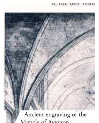
Ancient engraving of the Miracle of Avignon