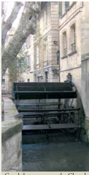
Canal that runs near the Chapel