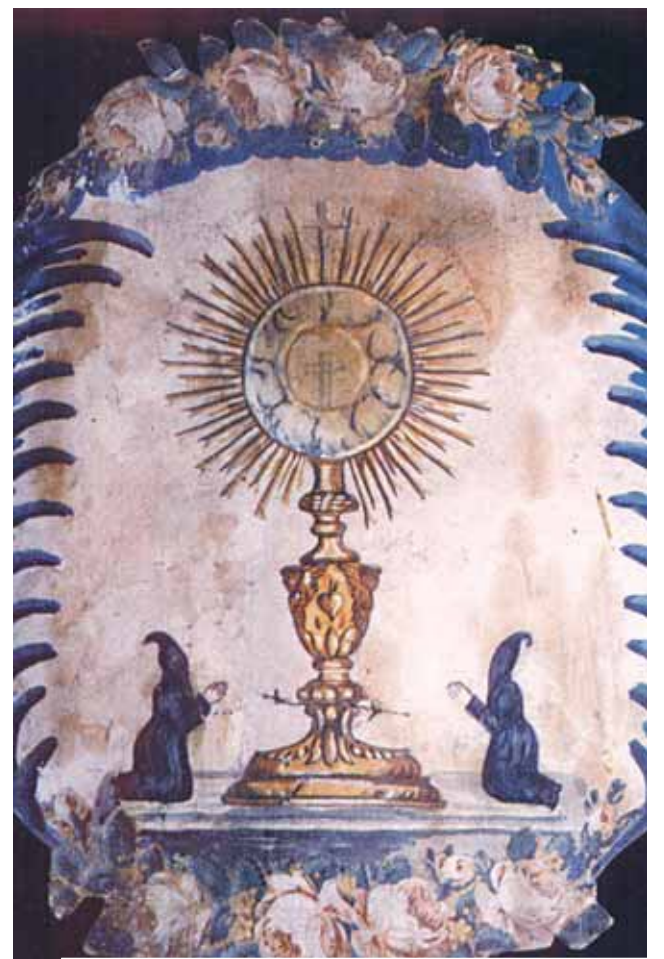
Fresco in the Chapel