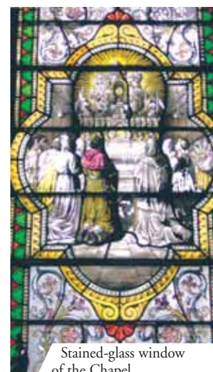
Stained-glass window of the Chapel