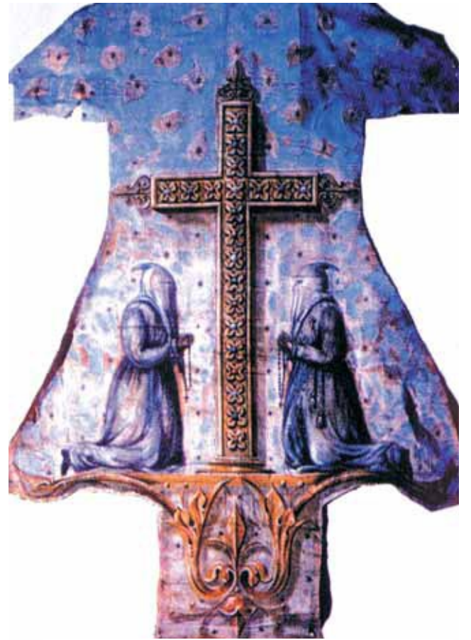
Cassock of the Gray Penitents