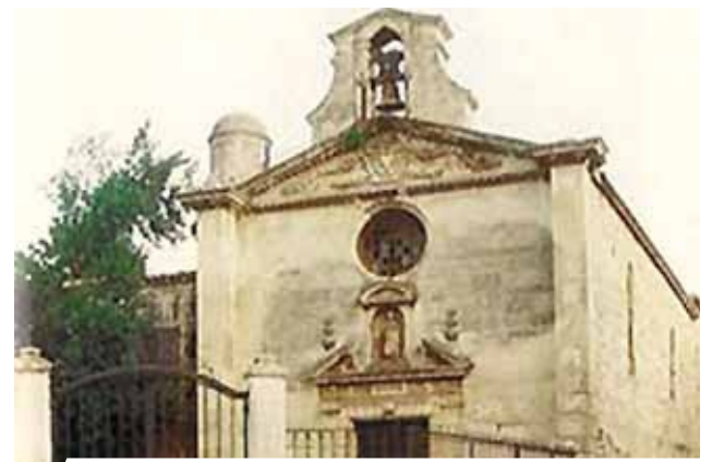
Facade of the Chapel of the Gray Penitents