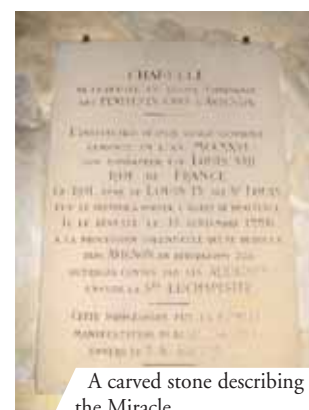
A carved stone describing the Miracle