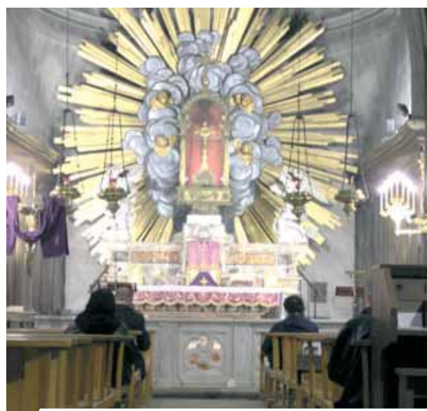
The Altar where the Miracle took place