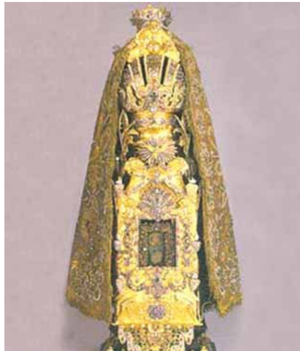
Reliquary containing the Host of the miracle known as Wunderbarlichen Gutes

The Eucharistic Miracle of Augsburg, is known locally as Wunderbarlichen Gutes – “The Miraculous Good”. It is described in numerous books and historical documents that can be consulted in the civic state library of Augsburg. A stolen Host was transformed into bleeding flesh. In the course of the centuries, several analyses were completed of the Holy Piece that have always confirmed that human flesh and blood are present. Today the Convent of the Heileg Kreuz (Holy Cross) is taken care of by the Dominican Fathers.