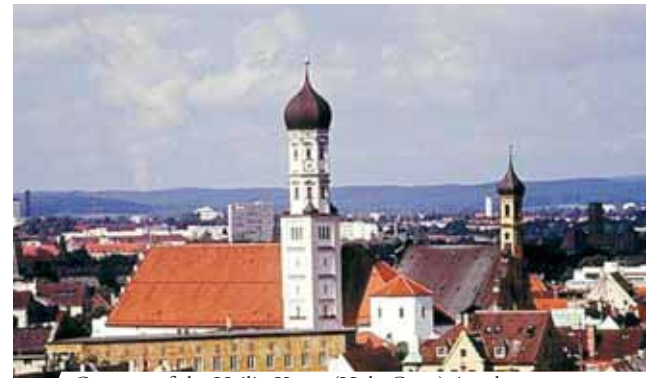
Convent of the Heilig Kreuz (Holy Cross) Augsburg