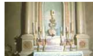
Chapel inside the cathedral where the reliquary of the miracle is kept