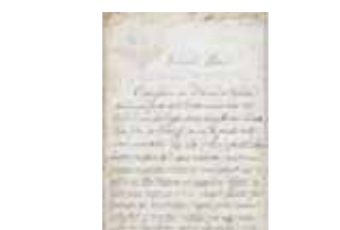
Letter of the rector of Saint Mary alle Terme, dated March 22, 1888, in which he gives thanks for the gift of part of the reliquary of the Incarnate Host conserved in Alatri