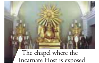
The chapel where the Incarnate Host is exposed