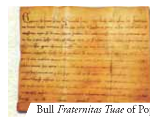
Bull Fraternitas Tuae of Pope Gregory IX