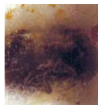
Detail of the reliquary

The most authoritative testimony regarding this miracle is found in the Bull "Fraternitas tuae" (March 13, 1228) written by Pope Gregory IX in response to Bishop Giovanni V of Alatri. Here is the text: "Gregory, Bishop and Servant of the Servants of God, to Venerable Brother Bishop of Alatri, greetings and Apostolic blessing. We have received your letter, dearest brother, in which you informed us of a certain young woman misguided by an evil woman, who, after having received from the priest the Most Holy Body of Christ, held it in her mouth until the right moment to conceal it in a cloth. After three days, she discovered the same Body which she had received in the form of bread transformed into flesh, as everyone has been able to verify with their own eyes. Because both women have humbly revealed this to you, you