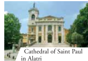
Cathedral of Saint Paul in Alatri