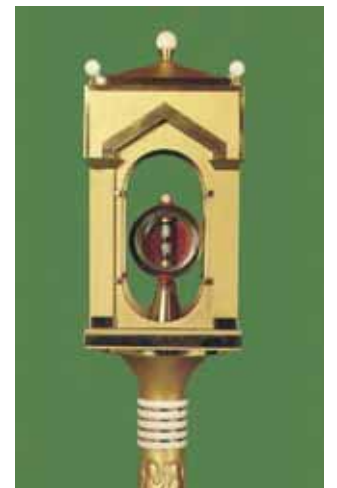
Monstrance where the reliquary of the miracle is kept