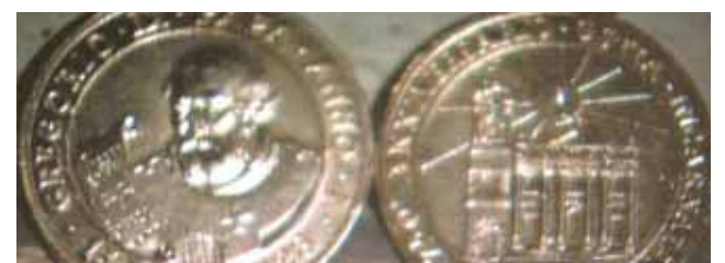
The 750th anniversary of the miracle was solemnly celebrated in 1978. For the occasion, a medal was coined which on front shows an image of Pope Gregory IX with the Bull and on back, the façade of the cathedral with the Host above